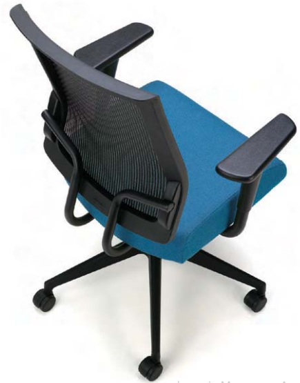
shown in Messenger Azure by Maharam

Focus your attention on a chair line that skillfully combines clean design with ergonomic comfort and surprising affordability.