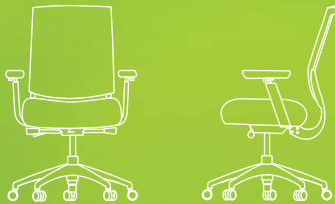
MODEL NO. 5624

Form No. C153 10/09 15K © 2009 Exemplus Corporation. Printed in the USA SitOnIt® Seating and We Get It® are registered marks of Exemplus Corporation. Focus™ is a trademark of Exemplus Corporation.