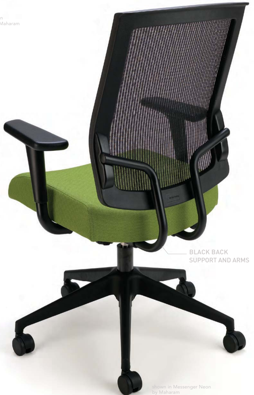
BLACK BACK SUPPORT AND ARMS