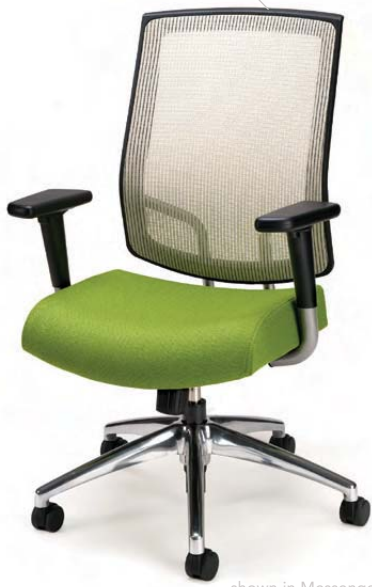
shown in Messenger Neon by Maharam