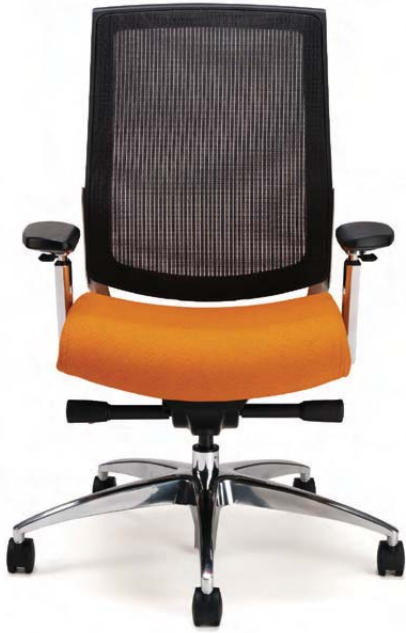
Executive Chair shown in Messenger Tangelo by Maharam