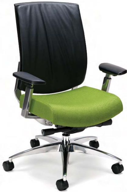
Executive Chair shown in Messenger Neon by Maharam