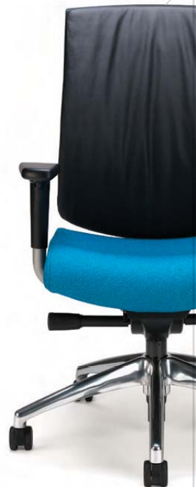
BRUSHED ALUMINUM BASE

When you're ready to recline, the Enhanced Synchro tilt smoothly moves your back and seat together for optimal motion and comfort. Seat slider, back tension and lock positions are all easy to adjust to fit each individual's needs. The waterfall seat relieves pressure from the back of the legs, allowing for healthy circulation. Our design and use of quality materials provide a superb initial sit combined with unparalleled long-term comfort.