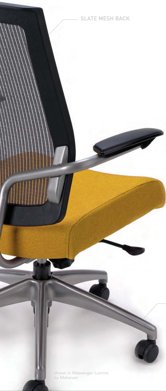
SLATE MESH BACK

It's all about full body support, natural movement and healthy circulation—in every position.