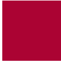
Salsa (SC6) 2 DAY