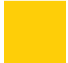
Honeycomb (SC16) 3 WEEK