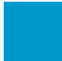
Lagoon (SC15) 3 WEEK