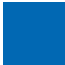
Blue (SC14) 3 WEEK