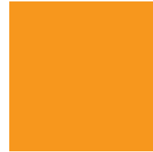
Carotene (SC13) 3 WEEK