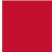
Red (SC19) 3 WEEK