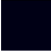
Black (SC1) 2 DAY

ANYTIME, FREELANCE, INFLEX, ONCALL, RELAY, ROWDY, AND VOLLEY