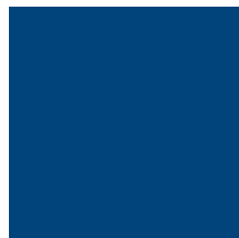
Navy (SC5) 2 DAY